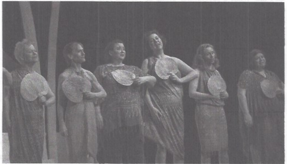
From Utopia Limited (2015)